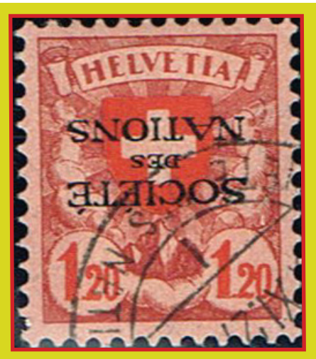
1.20f.s. Coat of Arms issue 1924 bearing inverted overprint. (1 of 50 recorded).

Although League and BIT service mail is not very common in general, several notable items in the exhibit have been highlighted using a red border to recognize their exceptional nature. All of these items are currently considered scarce, with fewer than 10 examples known, and in many instances, the only examples known to this author. While there is no official census for League and BIT service mail (Mail from/to the Leticia Commission is the exception and is noted), the quoted numbers are the result of personal research from articles, monographs, auction catalogs, exhibits, and review of specialized collections of these issues for nearly 50 years. Hence the author uses the terms "known" to indicate the numbers of similar items observed, and "recorded" to indicate actual numbers from either documented census on a given subject or recognized in specialized catalogs such as the Zumstein Specialized Catalog of Switzerland.