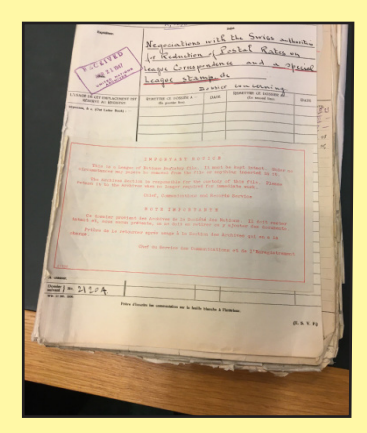
Dossier - League Archive Collection