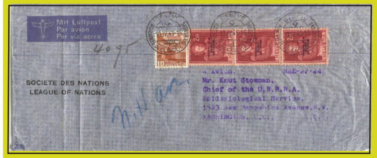
Service cover from the 20th and final League General Assembly bearing special assembly CDS.

For the 3rd, 4th, and 5th Assemblies, the Swiss PTT made available the circular cancel "Genève Special" for use on Assembly correspondence, Starting with the 6th Assembly (1925) and for all subsequent Assemblies, including the 20th and final Assembly (1946), the circular cancel "Genève Assemblee de la Société des Nations," was used.