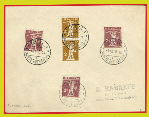
Very early cover bearing Genève 1 Société des Nations CDS posted at the Rue du Mont Blanc post office

On February 3, 1921, processing of the League's correspondence was transferred directly to the League's postal operations within the Hotel National and, after 1936, at the League's permanent headquarters at the Palais des Nations.