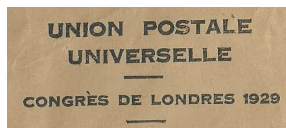
Congress, Type 3B 230x151mm envelope CC: 60x25mm Lines longer