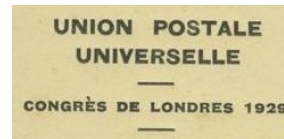
Congress, Type 3A 230x105mm envelope CC: 58x24mm 3 rows of text