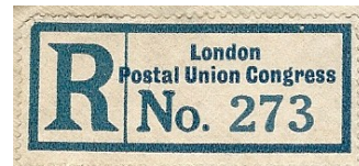
Label used On Registered mail