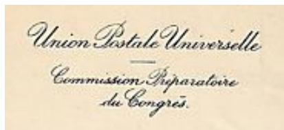
Preparatory Commission, Type 1