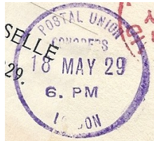
Type 2-Single Circle Used on parcels