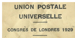
Congress, Type 3C 277x206 mm envelope CC: 60x29mm Lines still longer