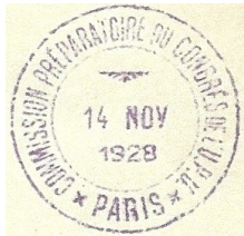
Preparatory Commission, Dispatching Mark