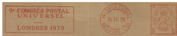
Congress, Neopost Demonstration, not used on Congress mail. Only example observed