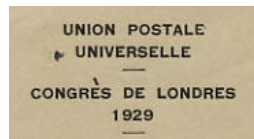
Congress, Type 2 127x103mm envelope CC: 39x20mm 4 rows of text