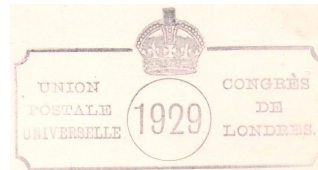
Congress, Cachet 2 Only observed on favor item Page 9