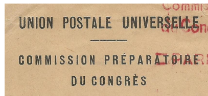
Preparatory Commission, Type 2