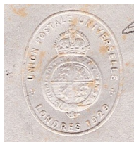
Congress, Type 1, Embossed on back flap, 128x103mm crème or gray envelope Nothing on front