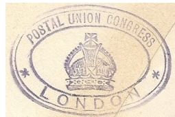
Congress, Cachet 1 Observed on cover, Page 9