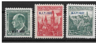
Czechoslovakia Sc. #236-38, 6 Oct. 1937