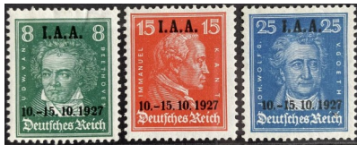
Germany Sc.#363-65, 10 Oct. 1927