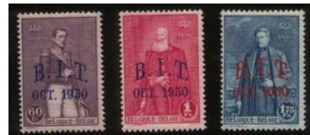
Belgium Sc. #222-24, 5 Oct. 1930