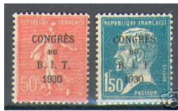
France Sc. #256-57, 23 Apr. 1930