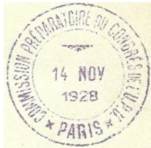
Preparatory Commission, Dispatching Mark