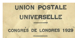
Congress, Type 3C 277x206 mm envelope CC: 60x29mm Lines still longer