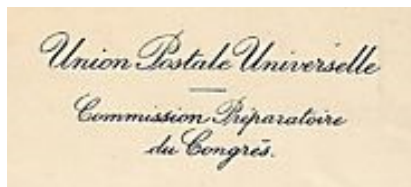
Preparatory Commission, Type 1