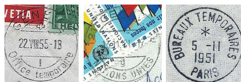
Special Cancels with no Conference named