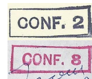
Geneva Cachets with no Conference named