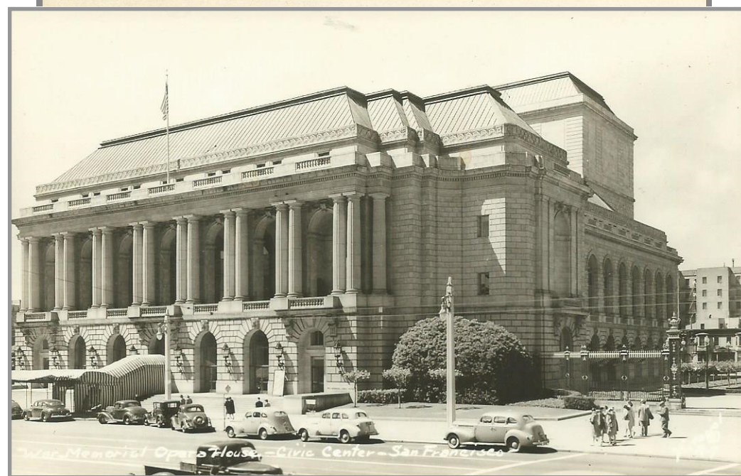
San Francisco War Memorial Opera House, Photo Post Card, No Division on back, Published by "EYE"