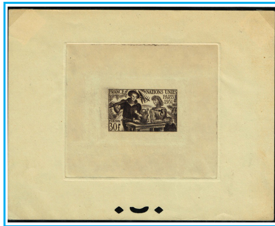
Sepia Inspection Proof (3 recorded - Gaines United Nations Philately [Gaines])

Possibly because of the brief time available, which was due to the lateness of the decision on Paris for the General Assembly site as a result of the construction of the new UN Headquarters in NY still not completed, the starting point for the design of the 1951 General Assembly issue was with a design proposed by Decaris showing a man and woman laborers with an inscription France Nation Unies Paris 1951.