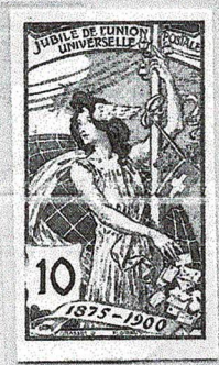
Essay of the artwork to be used on postal cards & stamps.

Eugene Grasset, a popular designer with studios in Lausanne & Paris, designed the allegorical figure of an art nouveau style woman grasping a telegraph pole from which the shield of Switzerland hangs while dropping letters. In the background is a globe symbolizing the international scope of the Universal Postal Union.