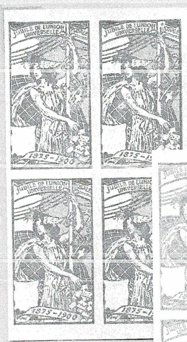
Enlargement of the illustration from postal card at right.