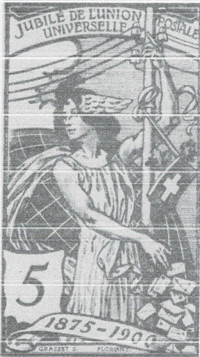
No country name appears in the design