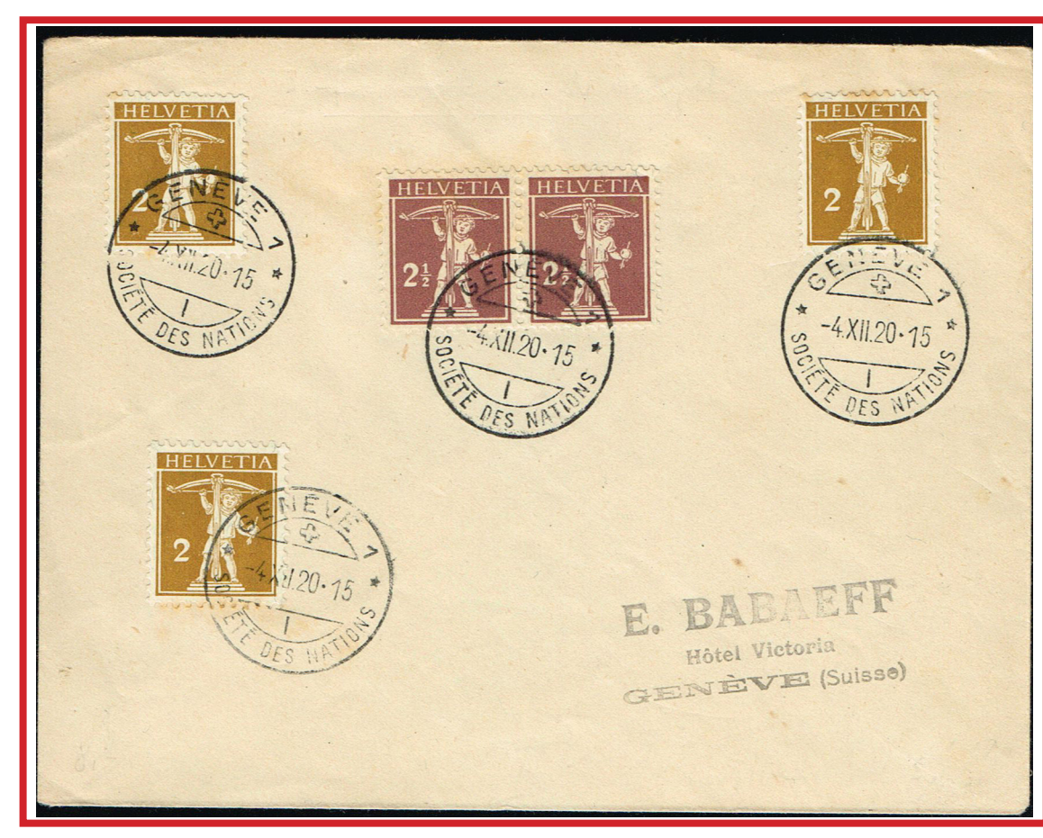
4 December 1920 - city (local) letter within Genève, Switzerland, paid 10cletter rate. Tied by Genève 1 Société des Nations hand cancel.

SdN hand cancel put into service 1 November 1920 and used through 6 July 1927, when it was replaced with the Genève 10 Société des Nations hand cancel. (Very early usage)